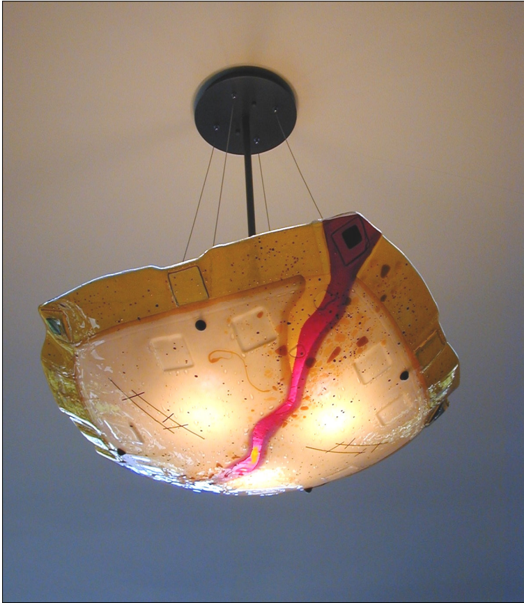
Peach with Amber and Red PD 809

Choose 1 background color and 2 accent colors