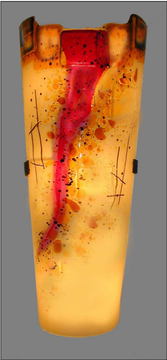
Amber over White with Red WD 701-23"